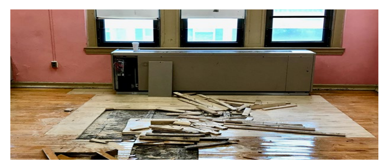
Photo Caption: Repeat flooding from malfunctioning classroom unit ventilator resulting in extensive damage and mold growth to newly installed flooring. The original flooring was replaced for the same reason just a few weeks earlier. An example of what happens if the "root causes" are not addressed.<sup>7i</sup>

The challenges of managing capital planning, financing, design and construction have grown and most districts are small and do not maintain capital planning, budgeting, financing or management capacity in their districts. Even in the large school districts, these functions are typically under-staffed, under-paid, and under-resourced compared to their capital management peers in the private sector. This makes it nearly impossible to secure experienced professional staff to manage the scale of the facilities inventory in the large school districts.